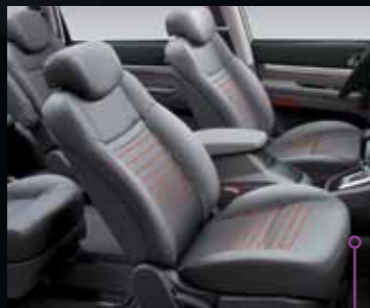
LEATHER SEATS WITH WARMERS TO FRONT*