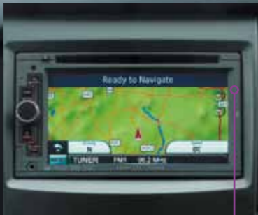
SAT NAV RADIO (OPTIONAL)