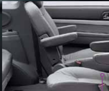
SEAT SWIVEL FEATURE